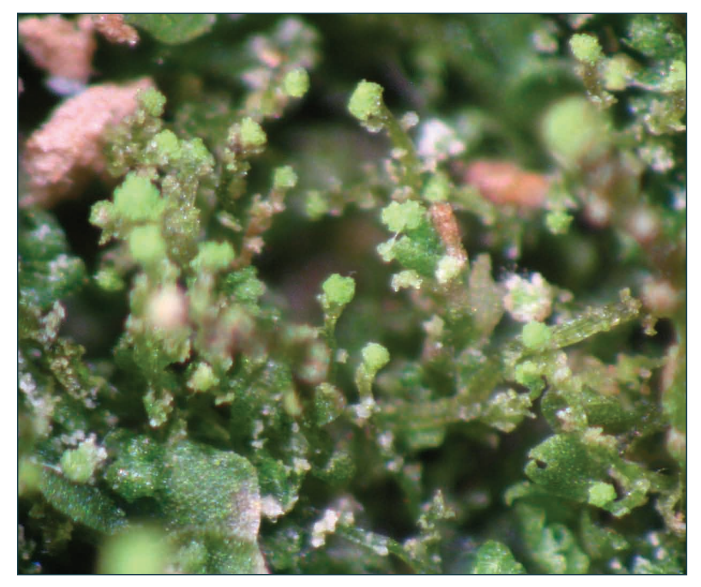
The liverworts Calypogeia suecica (narrow shoots with propagules) and Riccardia latifrons (larger thalli) grow only on decayed wood and are strong indicators of intact forest.