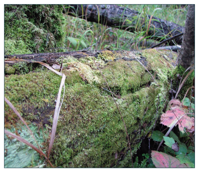
Decayed aspen log supporting a variety of bryophyte species in intact forest.

The substantial influence of bryophytes on ecosystem processes is in part related to the high biomass they can attain on the ground beneath closed forest canopies, where they have been shown to regulate forest soil moisture and temperature, nitrogen fixation and nutrient sequestration, and tree regeneration, as well as provide habitat for invertebrates and fungi. However, the specific substrate requirements and unique physiology of bryophytes make them susceptible to changes in local habitat and growing conditions following disturbance. Many species colonize only wood of a certain type (broadleaf or conifer) and decomposition stage. Furthermore, unlike larger vascular plants, mosses and liverworts are unable to control their internal water balance, making many species dependent on moisture from their immediate surroundings for continued growth and survival.