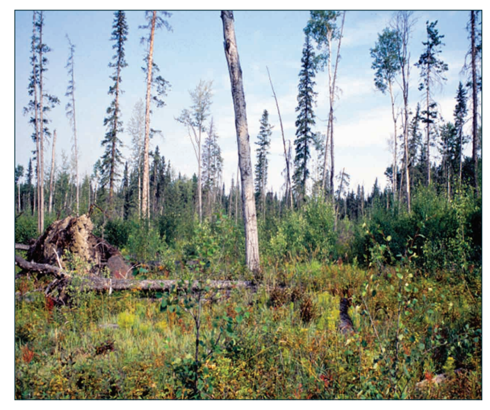
Conifer-dominated forest with low (10%) retention after experimental harvest.

The relative abundance of broadleaf and conifer trees among the sampled forest stands was also found to be an important determinant of bryophyte richness and composition, and this was unrelated to the degree of harvesting. Conifer-dominated forest supported a greater number of liverwort species than mixed forest, partly because intact conifer forest had higher moisture levels. The two forest types differed in terms of moss and liverwort composition, and each contained unique indicator species. Some indicator species, for example, preferentially colonize conifer wood, whereas others colonize broadleaf wood. Maintaining variation in forest canopy composition in managed mixedwood forests will be critical for ensuring that natural variation in bryophyte communities is preserved.