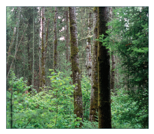
High abundance of bryophytes on aspen trees in intact forest.

Bryophytes that preferentially colonize decayed wood (epixylic species) and the bark of trees (epiphytic species) declined in richness with any level of harvesting. Many species belonging to these groups were significant indicators