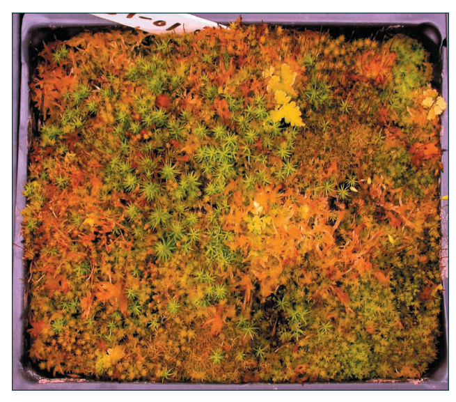
Bryophytes growing from forest soils in a growth cabinet experiment.

That being said, few liverwort species germinated from the mixedwood propagule banks. This may have resulted from several factors, including poor viability in buried propagule banks, unsuitable growth cabinet conditions during germination, or the strong preference of most liverworts in our study area for decayed wood as opposed to mineral soil substrates. The high sensitivity of liverworts