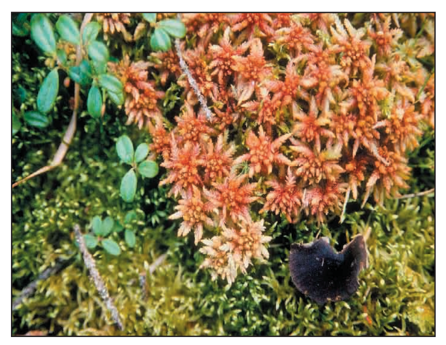
Figure 1. Bryophytes commonly found in peatlands, including Magellan's sphagnum, Sphagnum magellanicum (in red) and one of the three common feather mosses, big red stem moss, Pleurozium schreberi (in green).

Lack of information on plant communities can hinder the development of holistic forest management plans. This is particularly true of ecosystem types that, while appearing to have comparatively less