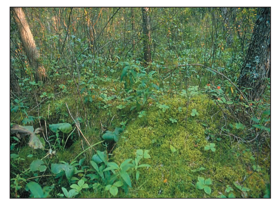
Figure 4. Various layers of canopy and drier hummocks with wetter hollows form diverse microhabitats in a wooded moderate-rich fen.

Figure 3. Rare orchids found in western Canadian boreal moderate-rich fens. Rarity rankings (S) are from Manitoba. See Alberta Native Plant Council document under Further reading.