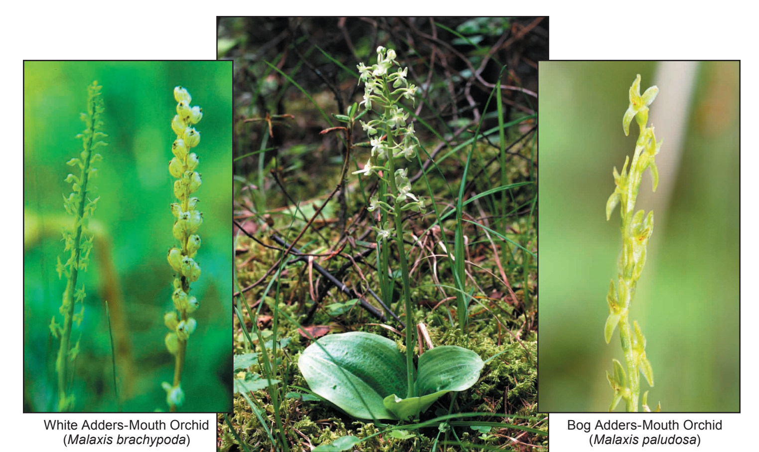
Round-Leaved Bog-Orchid (Platanthera orbiculata)

Figure 3. Rare orchids found in western Canadian boreal moderate-rich fens. Rarity rankings (S) are from Manitoba. See Alberta Native Plant Council document under Further reading.