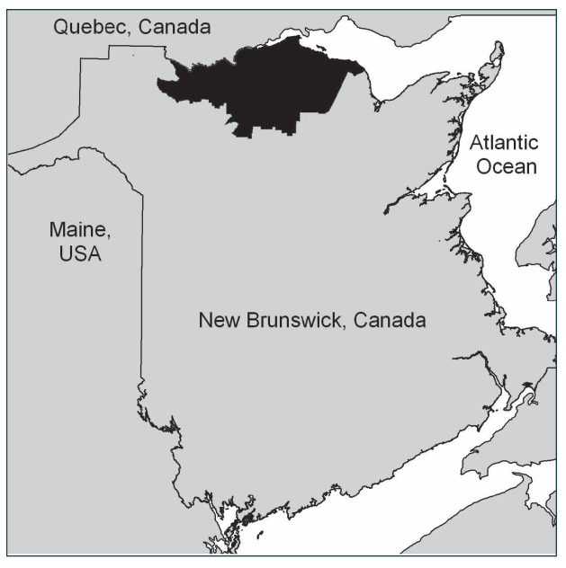
Figure 1. Location of New Brunswick Crown Timber License 1 (in black) within New Brunswick and eastern Canada.

social and ecological forest value indicators. However, in this research note we only report harvest volume and area treated by various silviculture systems. The objective of the analysis was to establish general relationships between performance of each forest value indicator and area allocated to reserves, intensive and extensive management areas. The salient questions were: