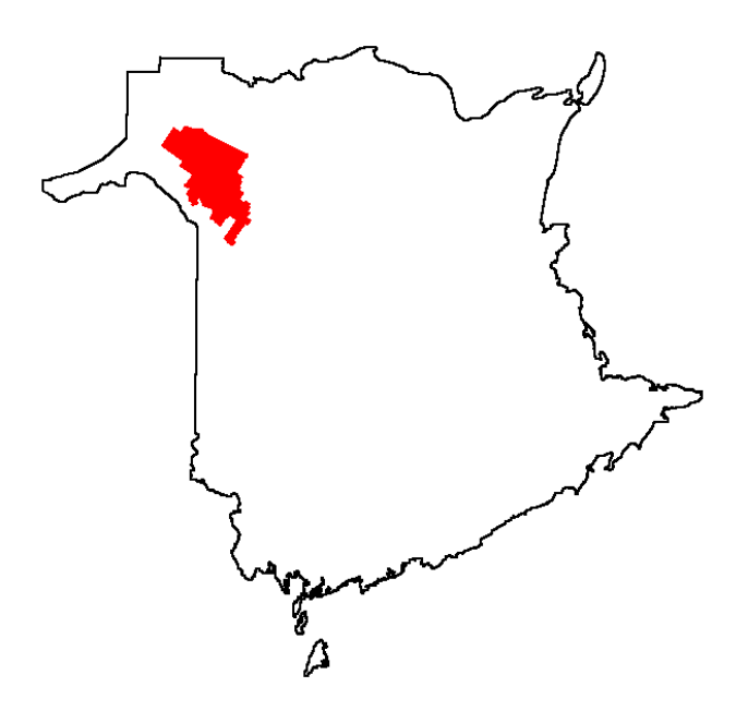
Figure 1: Location of study area, J.D. Irving Ltd's Black Brook District, in northwestern New Brunswick.

The study was conducted in J.D. Irving Ltd's Black Brook District, a 1900 km<sup>2</sup>, privately-owned area located in northwestern New Brunswick (Figure 1).