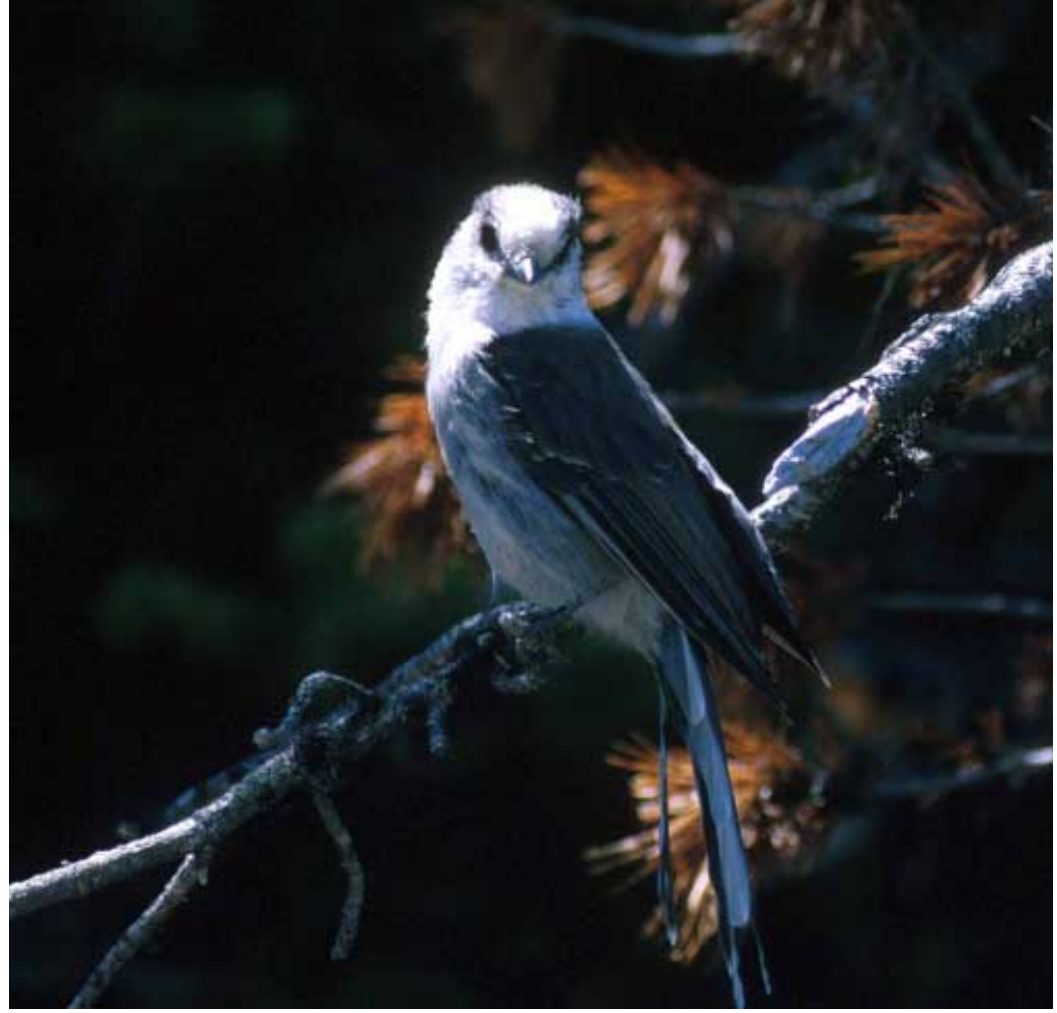
Grey jay, a typical bird of the Canadian boreal forest.