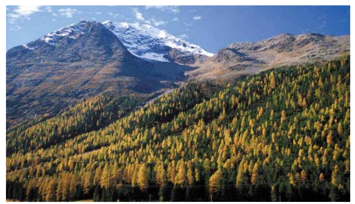
Alpine landscape similar to the Montafon area of Austria. Engadine, Switzerland.