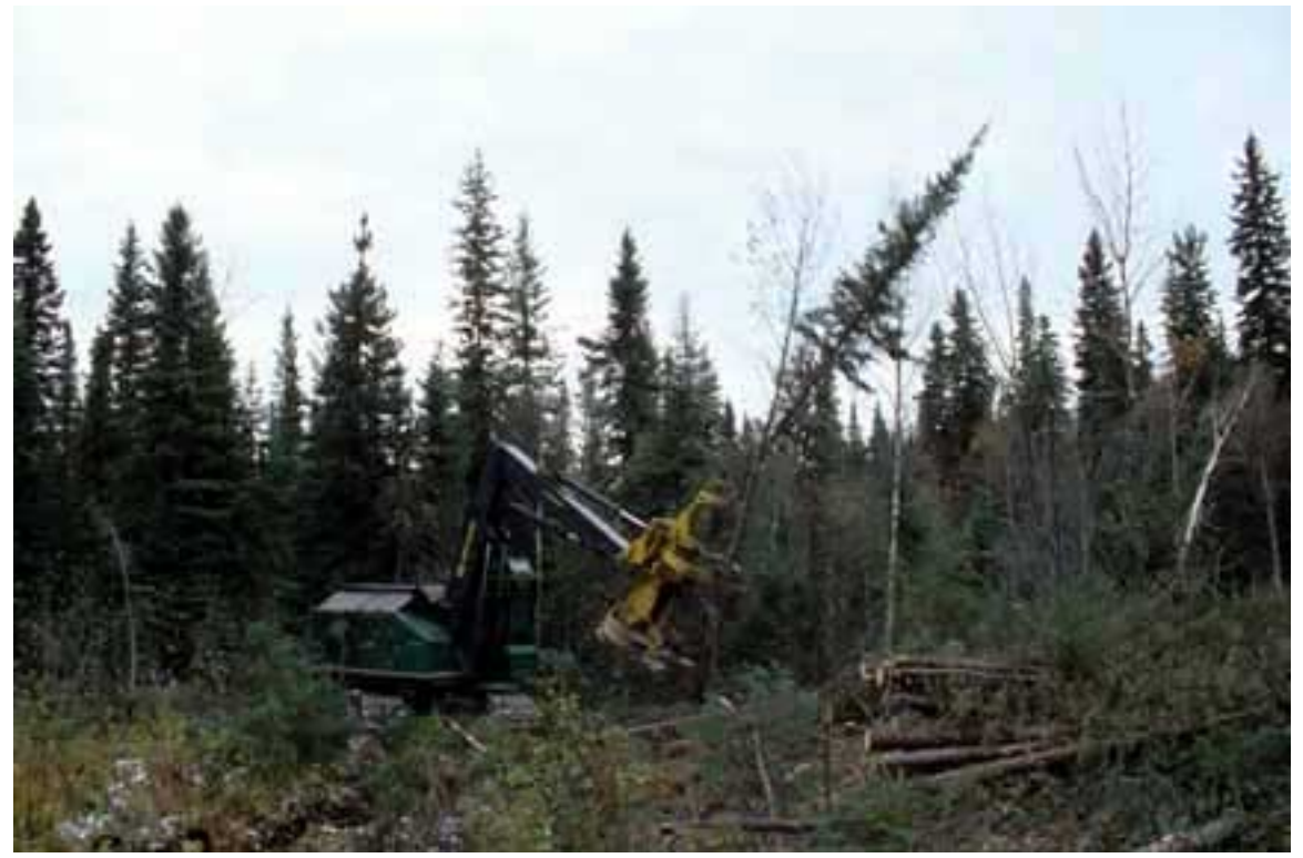
Harvesting black spruce in the boreal forest. Northern Ontario, Canada.

Suggestion from audience: Industry could provide us with a lot of coarse-filter information about what is happening that would help us assess where we are now. Industry should present different scenarios, and attach risks to these scenarios (e.g., risk of local species extinction, etc.).