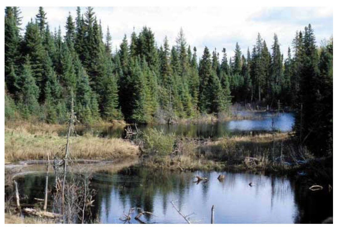
Boreal forest wetland. Northern Ontario, Canada.

By addressing biological diversity at a variety of temporal and spatial scales, BorNet can be the leader in supplying information for making informed decisions on boreal forest management (use and preservation). Policy-makers ranging from the European Union to First Nations in Canada are making decisions affecting the use and preservation of boreal forests. BorNet can be the definitive source of credible, appropriately scaled, and timely information.