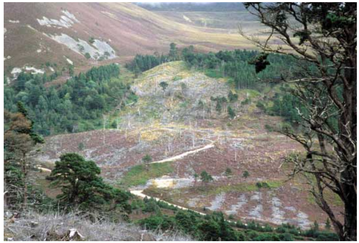
Recreating the boreal forest at Glenmore, Scotland, by removing exotic conifers and encouraging Scots pine.

ABSTRACT: The issue of land-use and land-cover change (LUCC) has a significant impact on global environmental change. In the boreal ecosystem, increasing forestry, agriculture, and resource exploration are causing fragmentation and isolation of forest patches, which will affect the natural biotic and abiotic patterns. Elk Island Park represents aspen parkland, the southern limit of the boreal forests. Land-use changes in the region over the last several decades – due to agriculture and other factors – are isolating the park. The objectives of this study are to assess current land-cover of the Beaver Hills/ Cooking Lake region and to quantify the rate and extent of land-cover change in the region as tools for the identification of key areas for conservation management. Land-cover and change maps will be created by analysis of Landsat satellite images from 1977 to 2000. Areas of high conservation value are located by integration of remote sensing land-cover data with other data sources such as location of endangered species. The project is in cooperation with Parks Canada, as part of the Beaver Hills/Cooking Lake Stewardship Initiative to promote conservation in the Beaver Hills region of central Alberta.