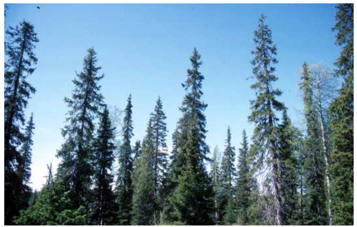
Norway spruce forest. Rovaniemi, Finland.