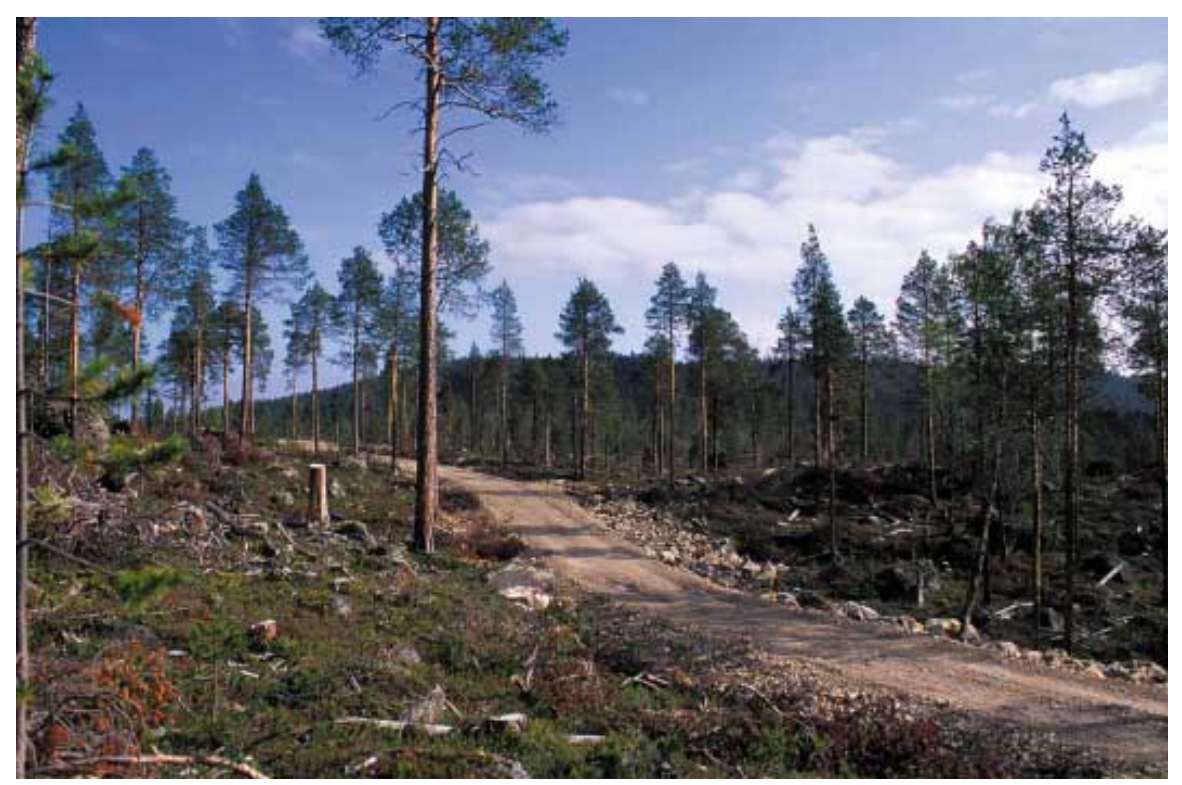
This style of cutting, involving two passes, has replaced clear cutting in some areas. Kirakka, Finland.

In Canada, we do less research on island biogeography theory than in Europe, because our landscape is less fragmented. Instead, we have a complex mosaic of habitats. However, Canadians need access to European information to keep us from going in the same direction.