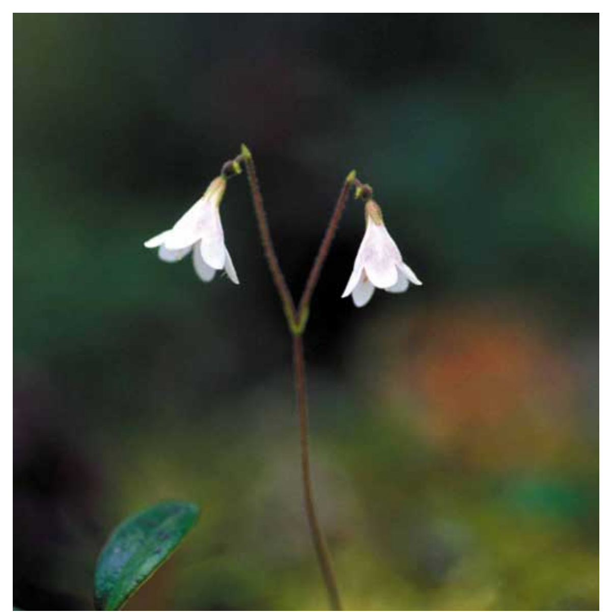
The circumpolar twinflower symbolizes the need to consider the boreal from a global perspective.

A multi-metric index will not be sensitive enough to warn us of rare/endangered species loss before it occurs. Several studies have shown that indicators do not correlate well with one another. The correlations are so weak that it would be hard to use them as an index. We need a more sensitive measure as an early warning system; however, collecting data for this purpose will be very expensive. We need an indicator system that looks after all species. Current assessment programs are biased against rare species; we should try to incorporate these in a cost-effective way. On a coarse scale, indicators (e.g., of amount of dead wood) are useful. In summary, by looking at a comparison of different disturbances or human footprints (e.g., from Europe to Russia to Canada), we could study how variation in disturbance correlates to different indicators.