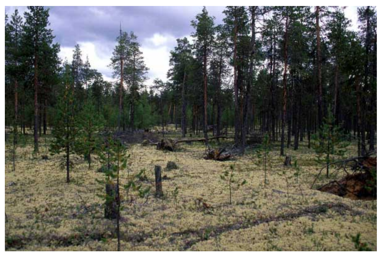
Scots pine forest with ground layer dominated by Cladonia lichens. Kola Peninsula, Russia.

The annual harvest in Russia is approximately 120 million m^3 , about half of which goes to foreign markets.