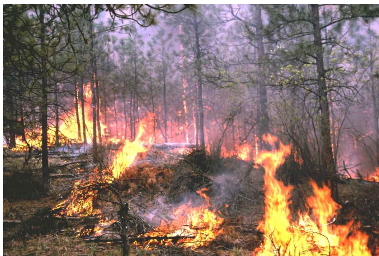
Fires such as this one in the Okanagan in British Columbia may become more frequent due to increased drought conditions brought on by climate change.

Western Canada may see warming between 2 and 5 °C with possible decreases in summer precipitation. These factors may lead to increased summer continental drying that could result in an increased risk of drought. The most important aspect of climate change to foresters is the response of forests to management actions and natural disturbance under the influence of climate change. Under certain management and natural disturbance conditions, climate change may influence the risk of a landscape to change. For example, the predicted continental drying could increase the frequency of fires that